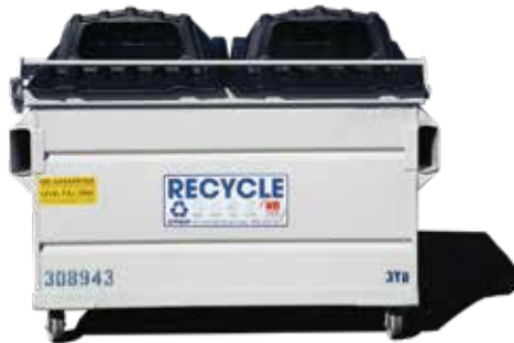
3-YARD 4'H x 4'W x 6'L