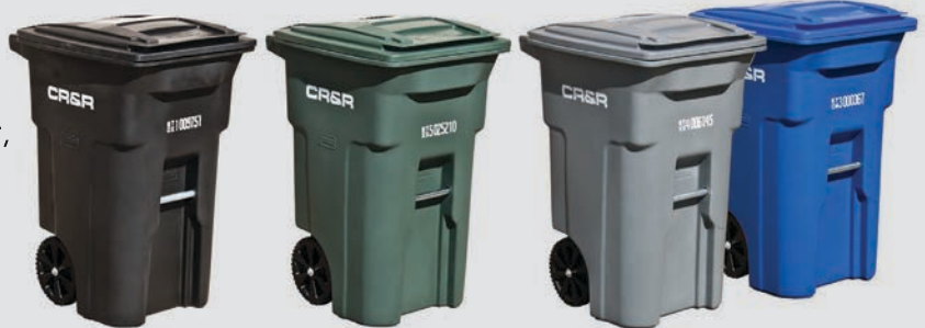
Grey or Blue