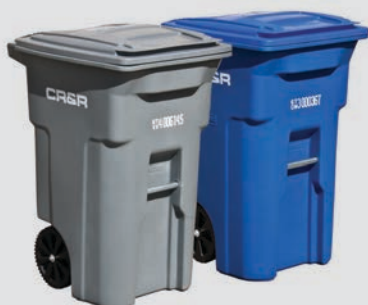
Grey or Blue